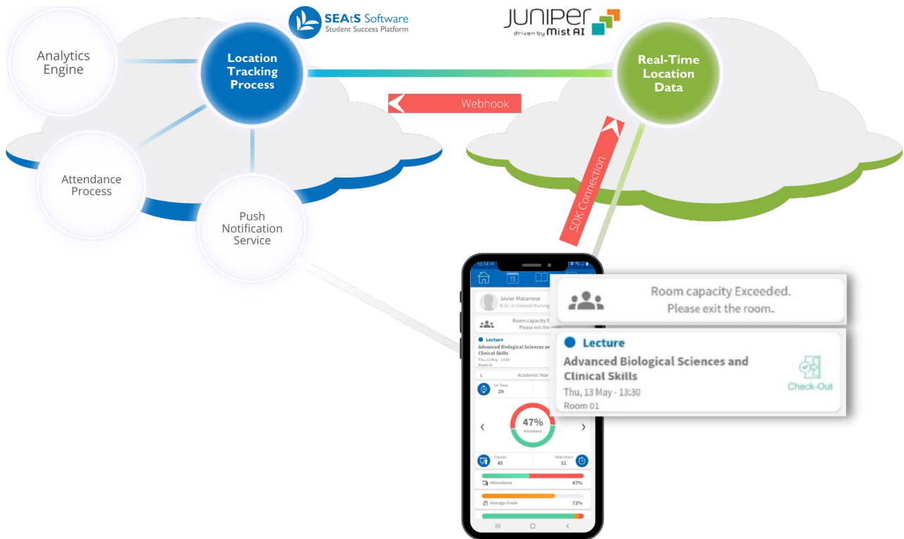
Figure 2: The process behind identifying over-capacity rooms.