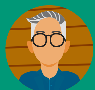
Rami Rahim, CEO Juniper Networks